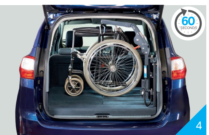
Your mobility device is safely stowed

With two lifting capacities, 40kgs and 80kgs the Mini Hoist is ideal for folding scooters and wheelchairs.