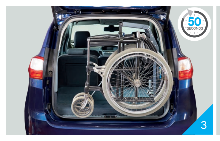
Press the button to begin hoisting