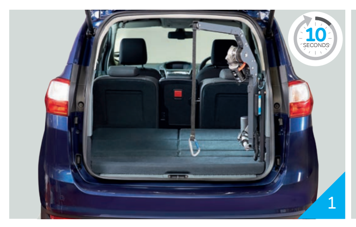
Pull down attachment strap